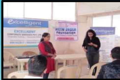
Prevention of Sexual Harassment Training for housekeeping staff at Kadugodi