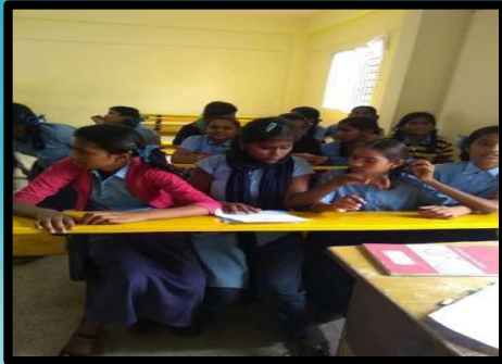
Doddanagamangala School Session