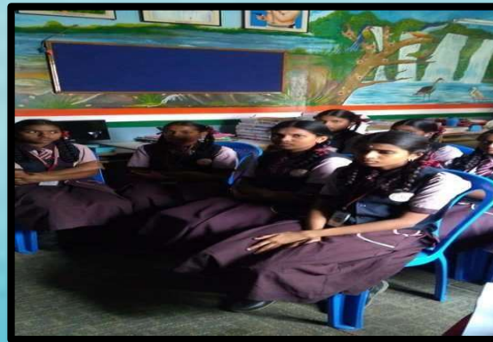
S. K. Public School Menstrual Awareness Session