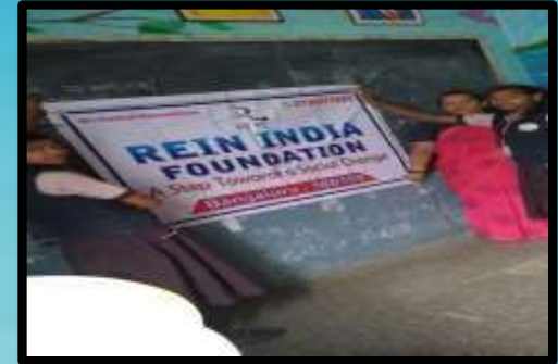
Awareness Session at Government aided school Doddathoguru