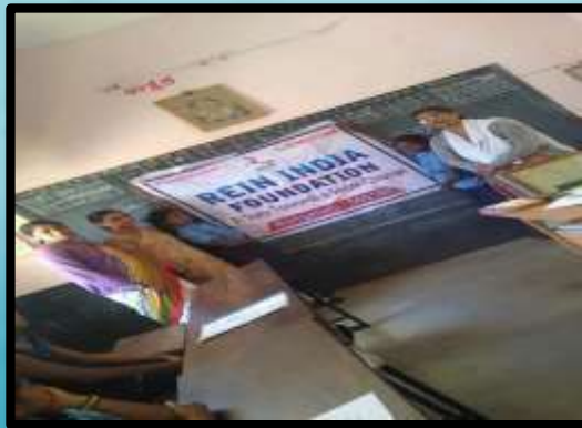
Menstrual Awareness Session at Parapaanna Agrahara Primary School